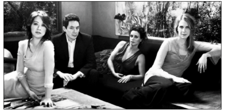
Featuring a set including classics from Beethoven, Haydn, and others, the internationally respected Daedalus Quartet will perform in the Mary Craig Auditorium of the Santa Barbara Museum of Art on Tuesday, April 17th at 7:30pm. For tickets ($20 Members/$25 Non-Members), visit sbma.org.

SB Courthouse • Free • alsb.org • 1-3pm Sa, 4/14.