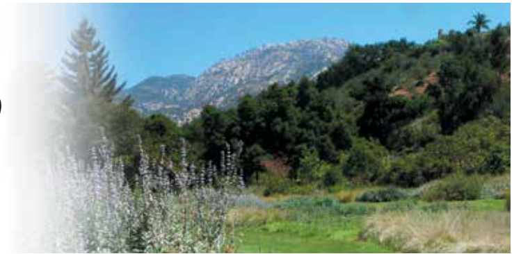
Santa Barbara Botanic Garden