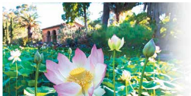
Ganna Walska Lotusland

PCPA Plays On! Though their stages may be dark this summer... PCPA Plays On! will be sharing a variety of virtual programs for all ages that are fun, educational, engaging, and theatre focused to keep you playing too! www.pcpa.org/PCPAPlaysOn/