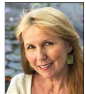
Feeling anxious, fatigued, depressed, or just experiencing isolation challenges?

Venta anual de libros de Planned Parenthood: El evento al aire libre y con distanciamiento social se llevará a cabo el 3 y 4 de octubre de 10am a 4pm en una nueva ubicación: 5726 Thornwood Dr. en Goleta. Se requiere usar máscaras. www.pppccbooksale.com